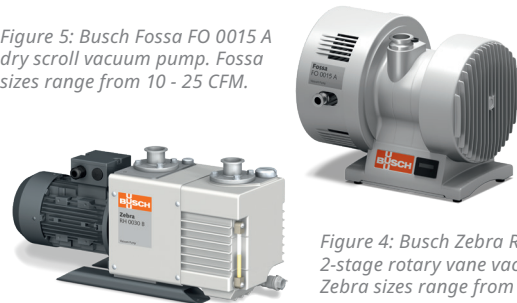
Figure 4: Busch Zebra RH0030 B 2-stage rotary vane vacuum pump. Zebra sizes range from 1.7 - 55 CFM.

Dry rotary lobe vacuum boosters are ideal to increase the pumping speed, together with a backing pump in a vacuum system. Some rotary lobe blowers use bypass valves whereas others can be equipped with a pressure switch or Variable Frequency Drives (VFD) (Figure 6).